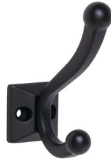
PXB-BN05-211 Available in 2 sizes/5 finishes