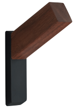
PXB-WM05-111 Available in 3 finishes