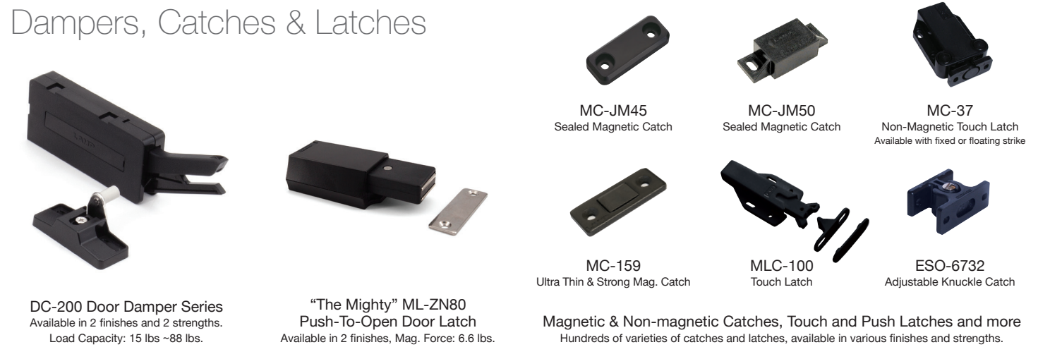
DC-200 Door Damper Series Available in 2 finishes and 2 strengths. Load Capacity: 15 lbs ~88 lbs.