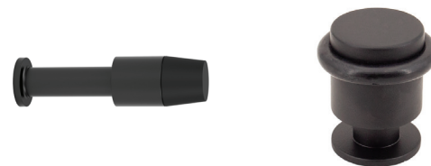
DSD-03 Wall mount