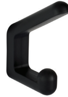
PXB-GR05-211 Available in 6 finishes