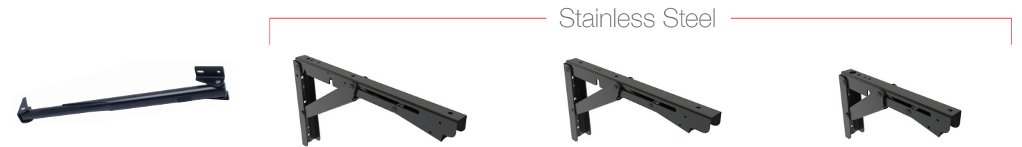
388 Series Available in 2 finishes and 4 sizes. Load Capacity: 77 lbs ~176 lbs/ea