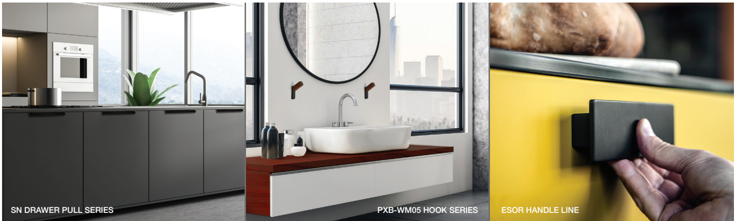
SN DRAWER PULL SERIES