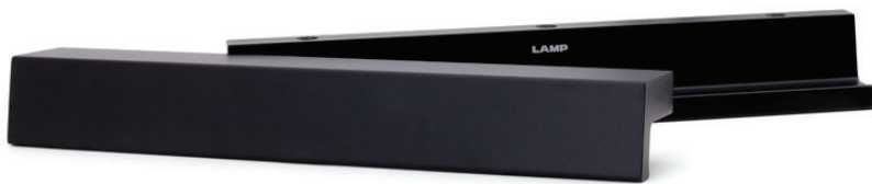
ALH Handle Series

Available in 3 Anodized Finishes: Matte Black, Matte Silver and Satin, with 5 Lengths to chose, from 2" to 39-3/8".