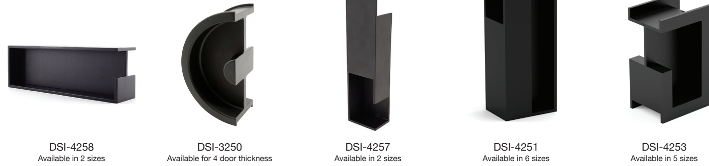
DSI-4258 Available in 2 sizes